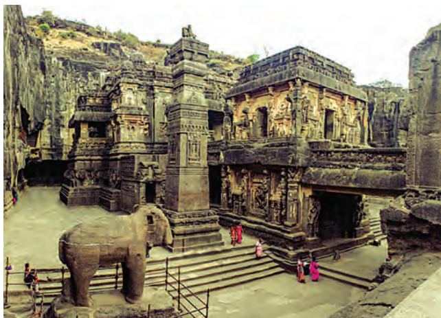
Kailasa Temple, Verul

‘Cultural and Natural Heritage Management’ is one of the main aspects of applied history. The work of conservation and preservation of the Cultural Heritage falls under the jurisdiction of the Archaeological Survey of India and India’s State Departments of Archaeology. Beside, INTACH (Indian National Trust for Art and Cultural Heritage) is actively working in this field. The work of conservation and preservation of cultural and natural heritage requires participation of experts from various fields. They need to be duly aware of the cultural, social and political histories of the heritage site. Principles of applied history are useful in creating the awareness among them. Thus,